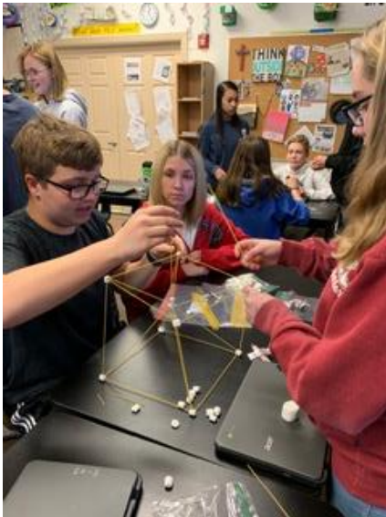
E-week presentations in Arizona (1 BLN-R member)