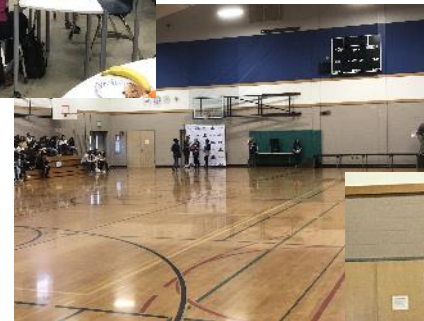
STEM Expo – Judges training and awards ceremony (Estimate 3 BLN and 1 BLN-R members)