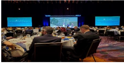
Habitat for Humanity Luncheon 2023