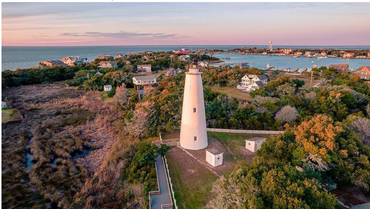
For the Beach: Ocracoke Island, North Carolina