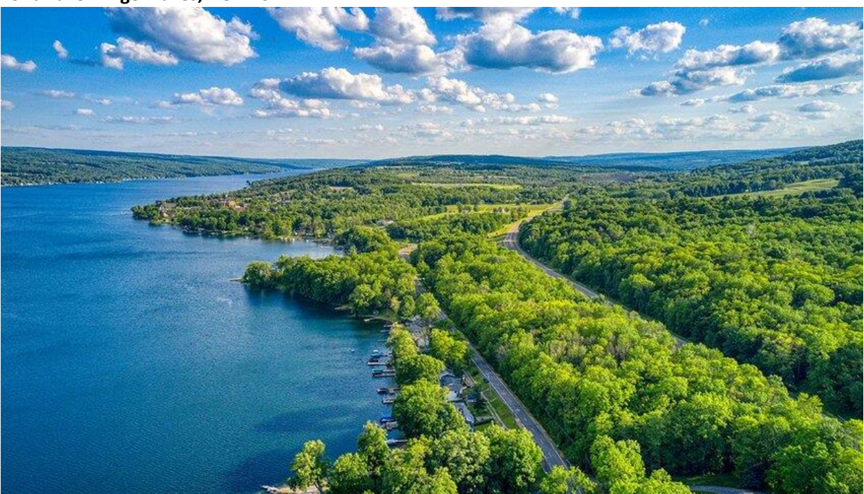
For a Lake: Finger Lakes, New York