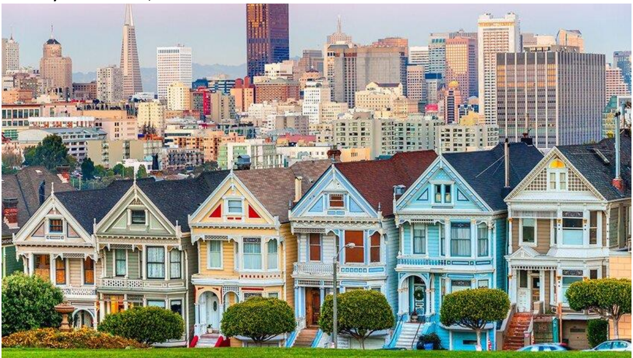
For a City: San Francisco, California